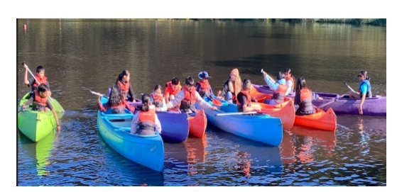
Canoeing in the lake